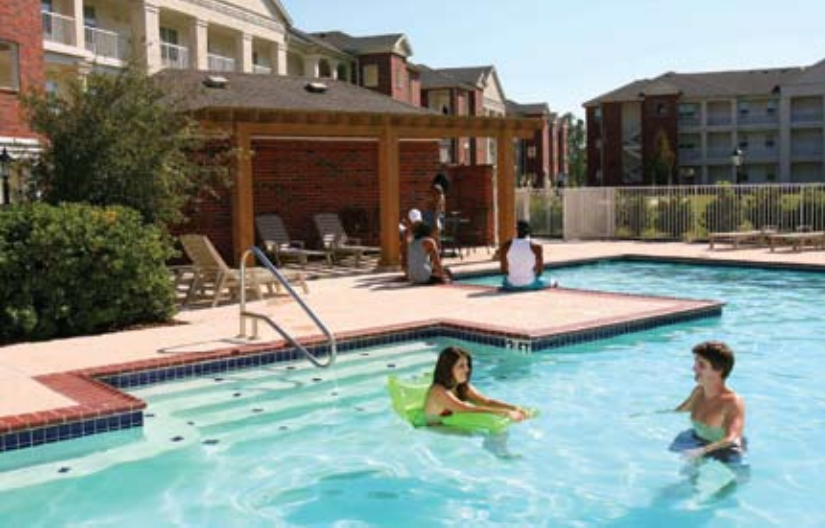
Residents of La Maison du Bayou enjoying the swimming pool.