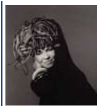
Ntozake Shange poet