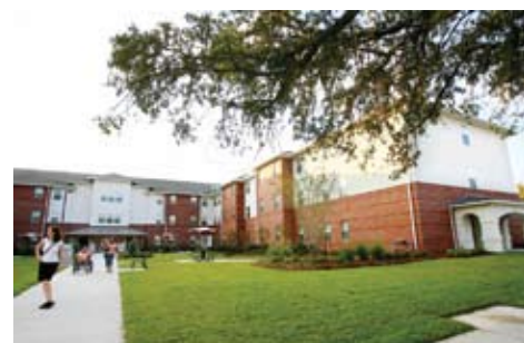
The contemporary style of Scholars Hall is popular with students and their families.

La Maison du Bayou, new in 2004 and renovated in 2008, includes seven three-story brick buildings with two-bedroom and four-bedroom apartments. Each apartment includes modern furniture, a full-