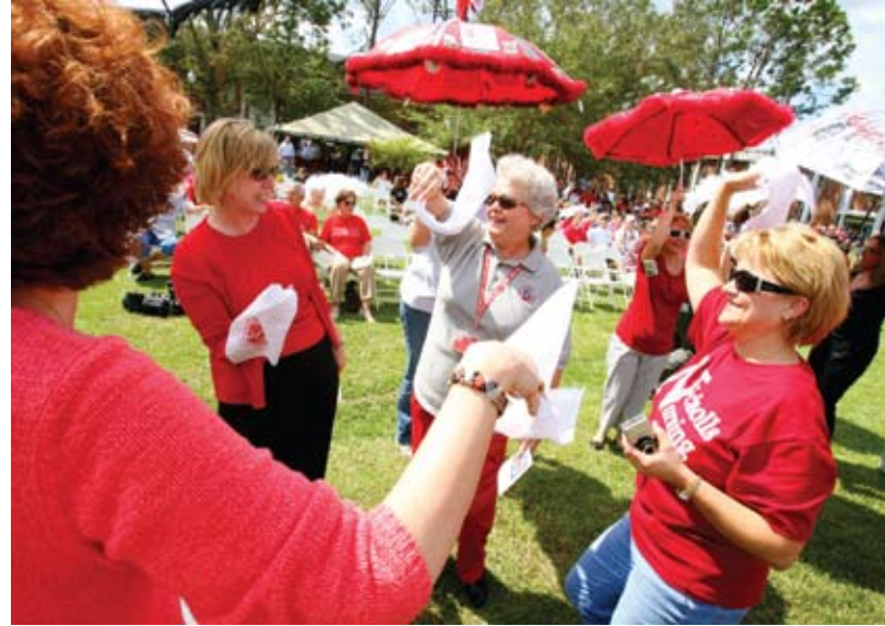
School of Nursing celebrants get into the second-line groove. Prizes were awarded for the most imaginatively decorated umbrellas.