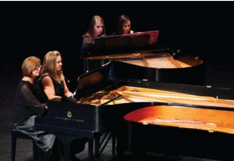
The "Monster Piano Concert" featured faculty, students, and alumni performing on Steinway pianos and other instruments in the Talbot Hall theater.