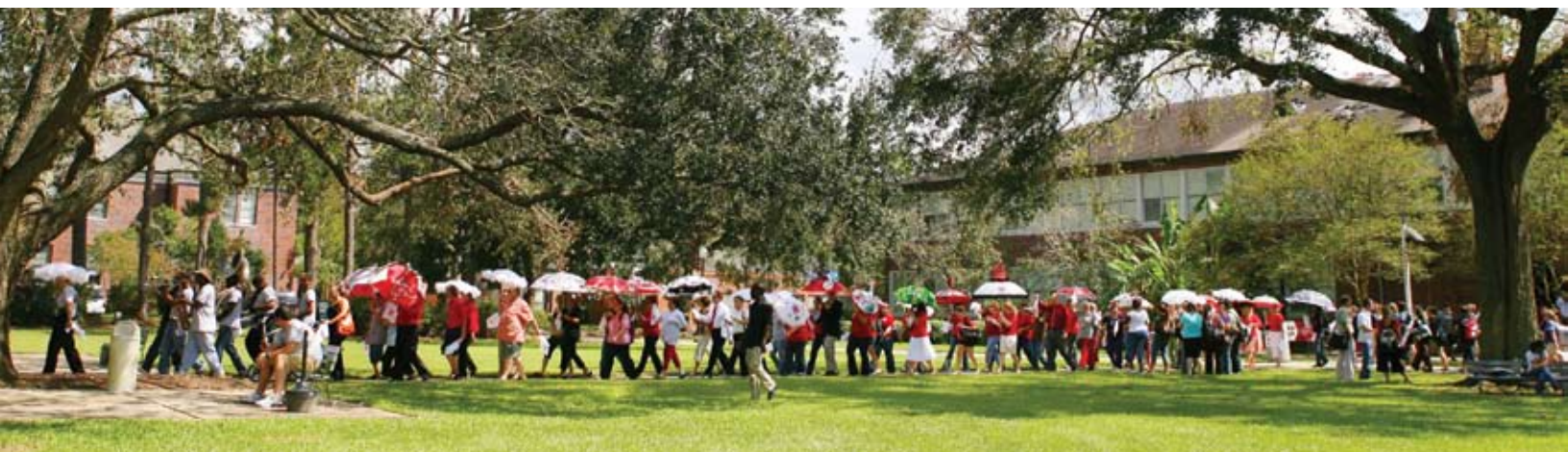
Hundreds of celebrants, dozens of them sporting colorful umbrellas decorated with Nicholls images and representations, paraded and danced from the Bollinger Memorial Student Union into the Quadrangle.