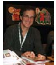
Garry Trudeau cartoonist