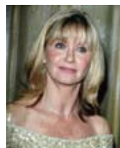
Olivia Newton-John pop singer