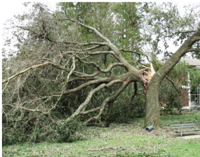
This mature live oak tree in the Quad near Beauregard Hall became a casualty of Hurricane Gustav's winds.

After Gustav, Nicholls immediately agreed to new requests from various first-responders. Betsy Cheramie Ayo Hall was designated as temporary housing for Troop C of the Louisiana State Police, accommodating a minimum of 40 state troopers at any given time. The Louisiana Department of Wildlife and Fisheries was granted the use of parking lots at Guidry Stadium as a staging area for more than 50 vehicles and boats. The U.S. Coast Guard was cleared to store and protect two boats on campus, with