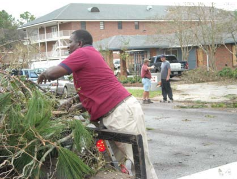
Nicholls reopened the campus after Hurricane Gustav with help from McNeese State University personnel.