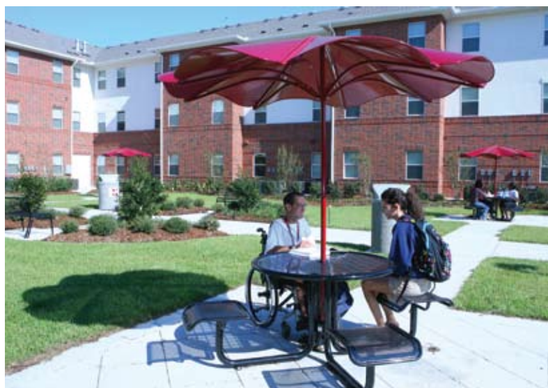
The courtyard in front of the new Scholars Hall is a popular gathering place.