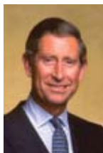
Prince Charles British royalty