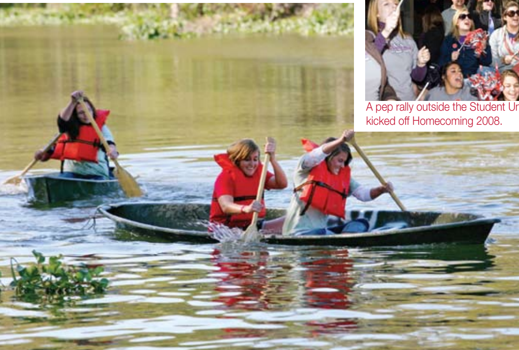
What would Homecoming at Nicholls be without the pirogue races on Bayou Lafourche? The Delta Zeta team, right, won this year's race.