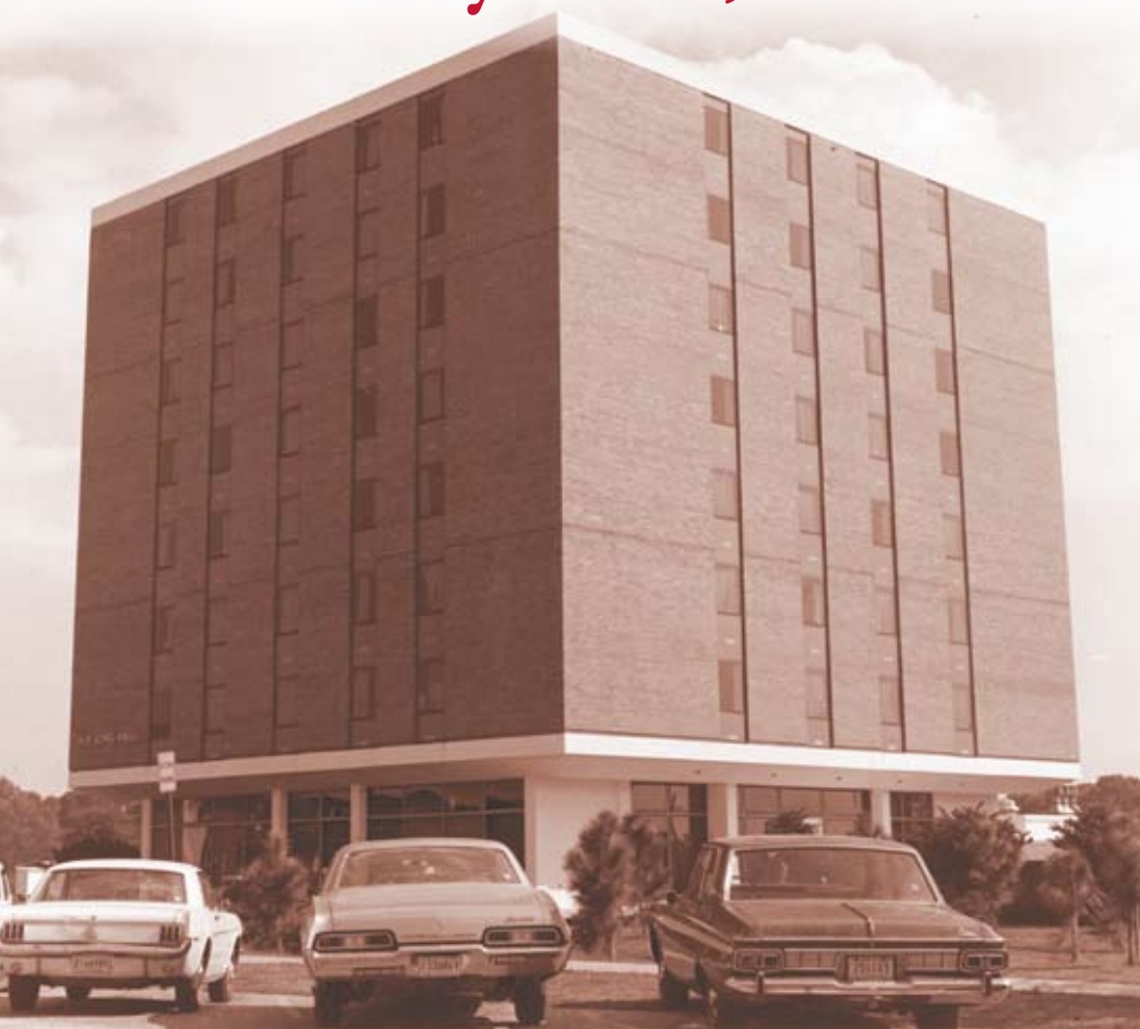
A brand-new Huey P. Long Hall, built in 1967, rises above the Nicholls campus.