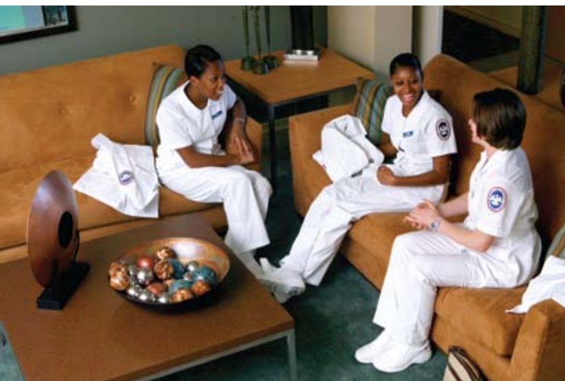
The well-appointed lobby of Scholars Hall offers several nursing students a comfortable place to relax.

The apartment complex also offers a landscaped courtyard; private parking; a clubhouse with media, game, and meeting rooms; a fitness center; a resort-style swimming pool; a beach volleyball court; and a convenience store featuring a sandwich shop. ♡