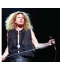
Robert Plant rock singer