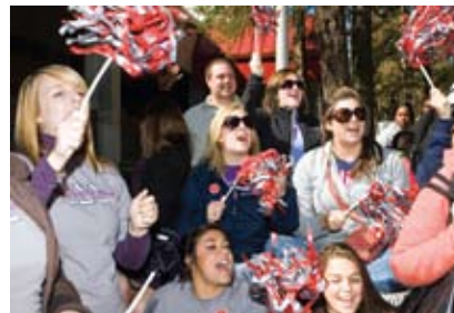
A pep rally outside the Student Union kicked off Homecoming 2008.