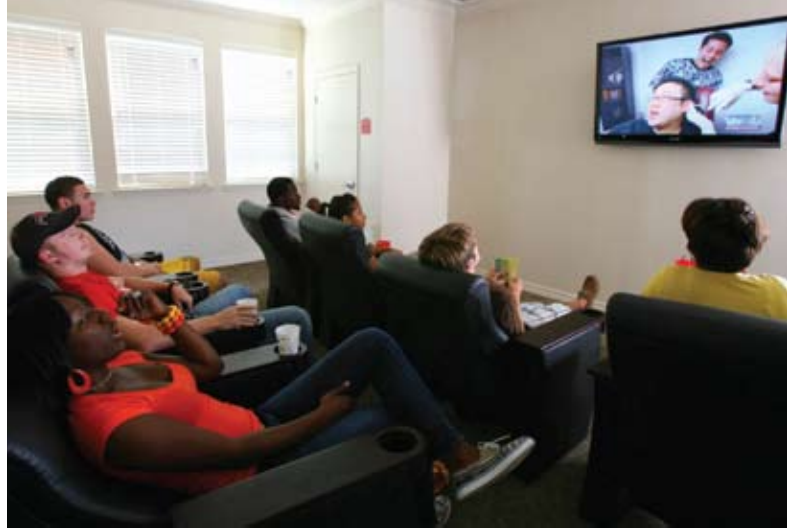
Students enjoy watching HDTV from leather recliners in the entertainment room of Scholars Hall.